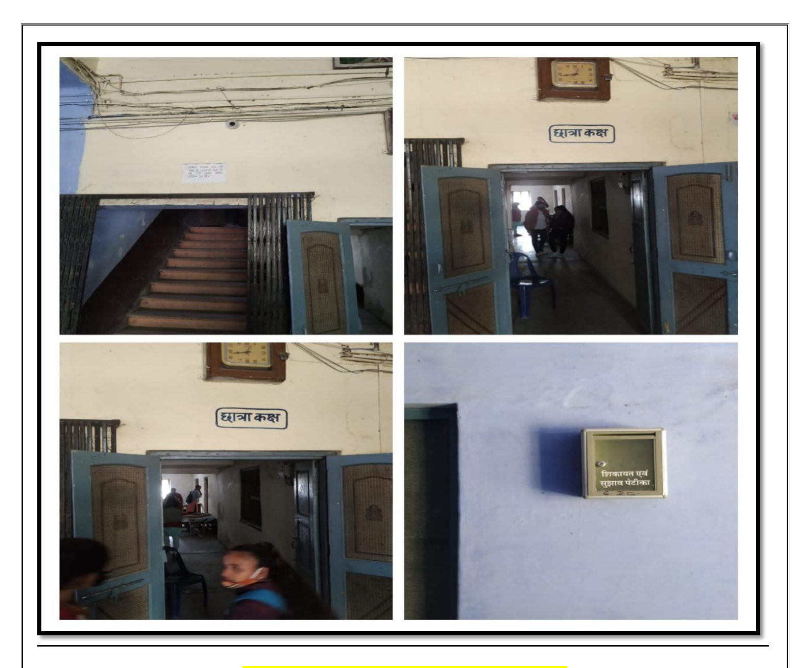
Complaint box, Girl's common room