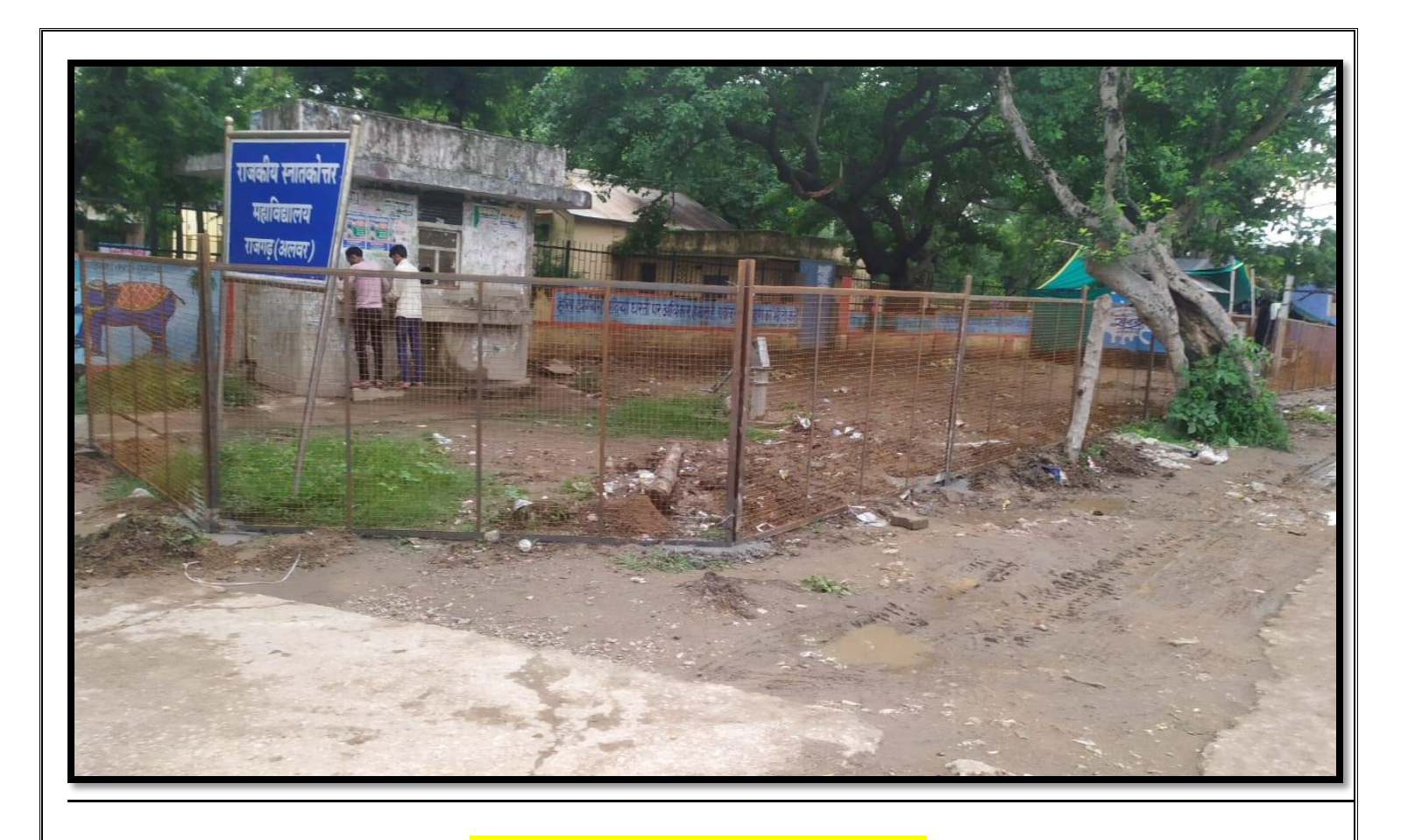
Govt. College Compound wall