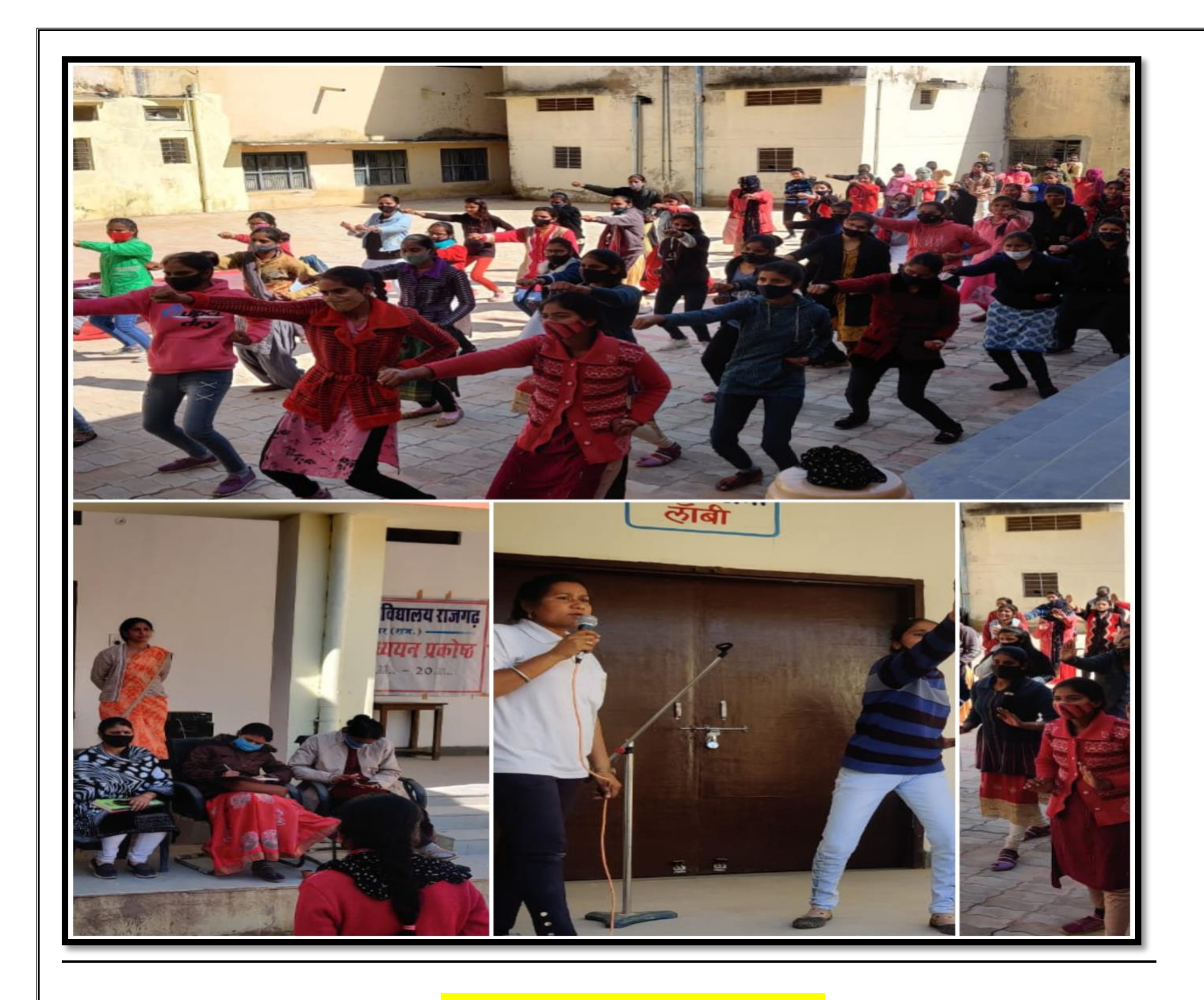
<u>Self Defense Training Camp</u>