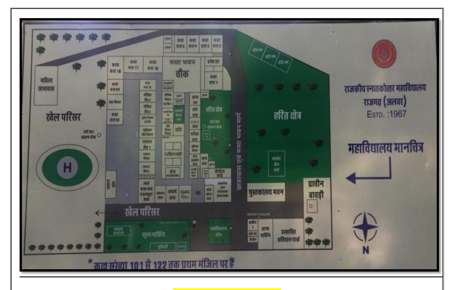
<u> Map of Govt. College</u>