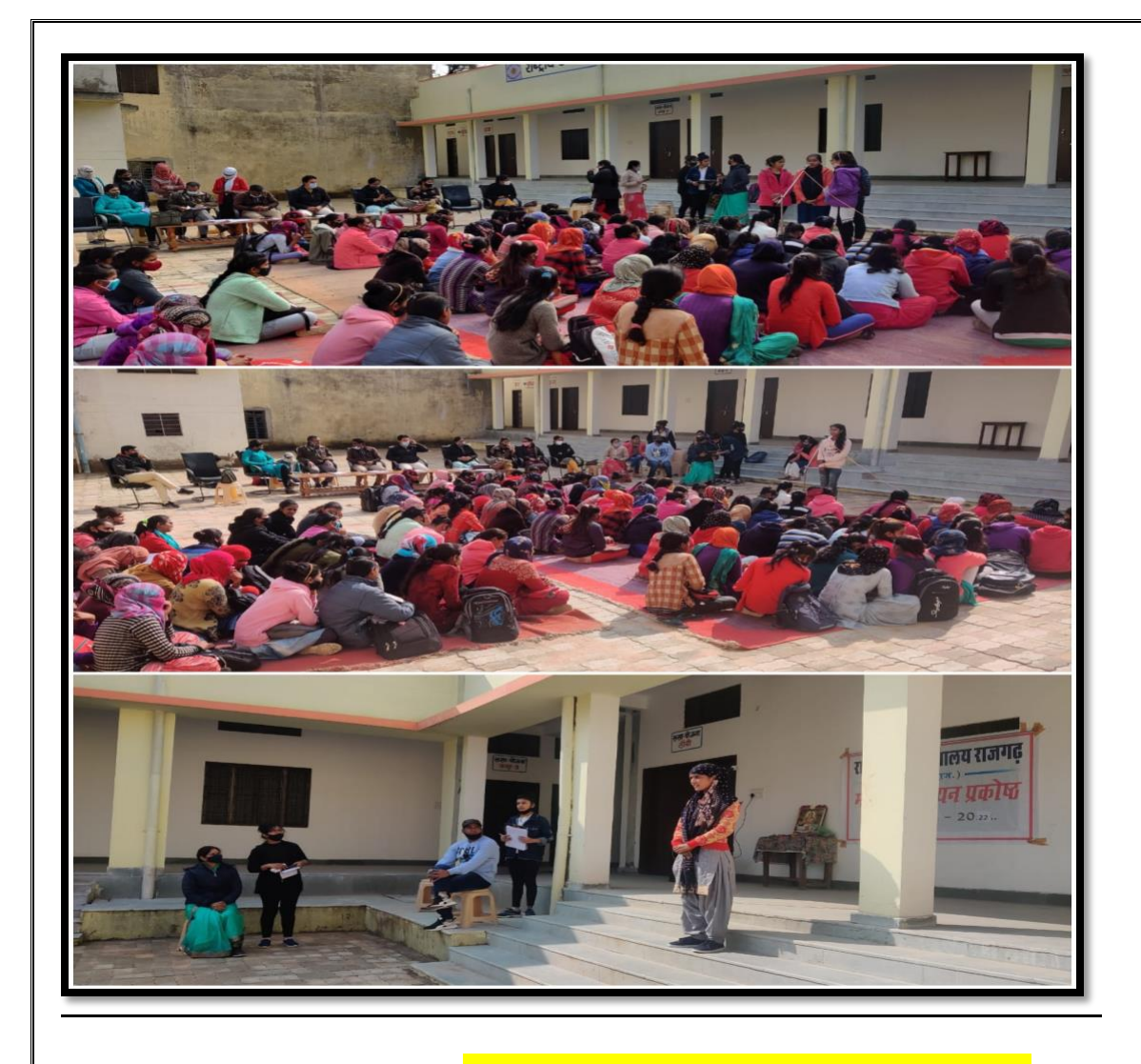
Solo and Group Song Competition