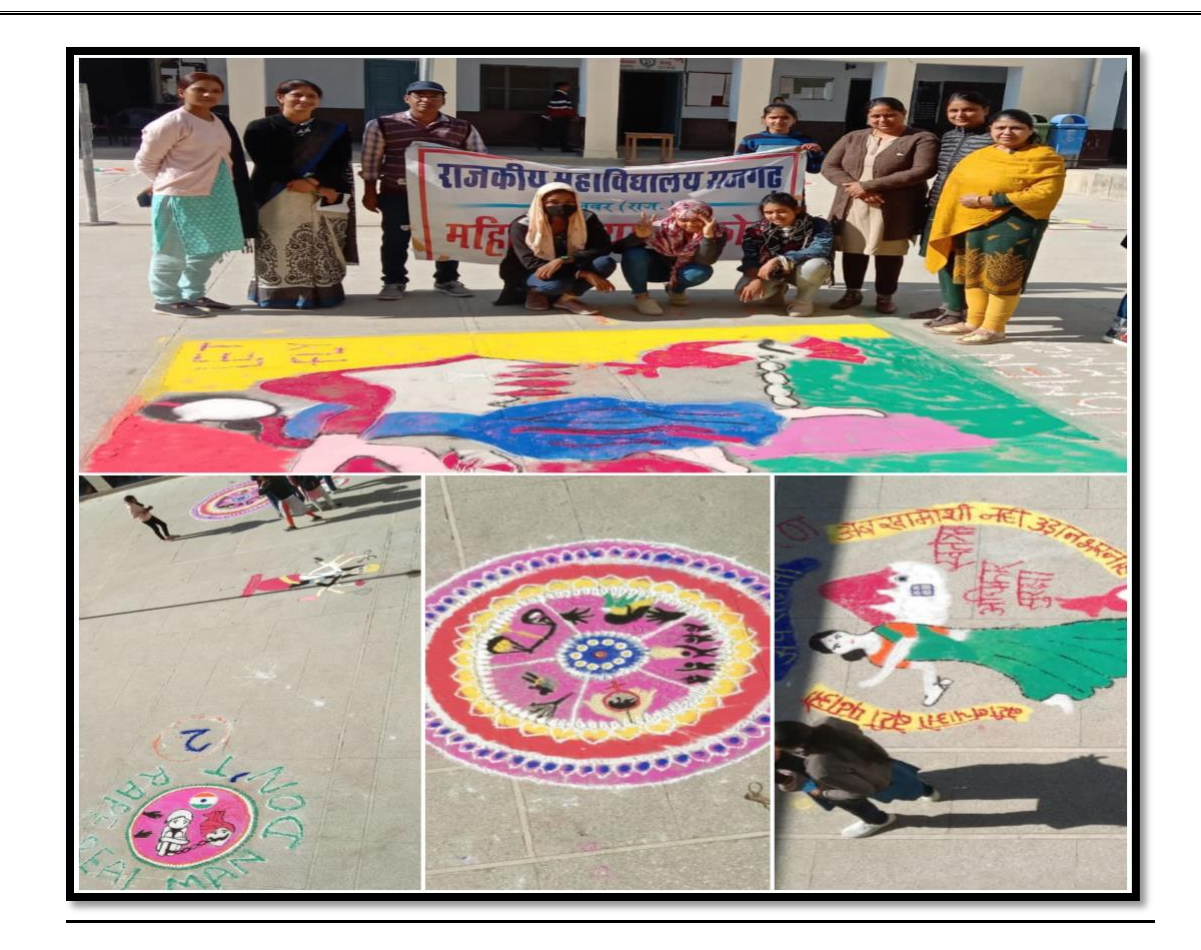
Rangoli Competition Art and Craft Competition