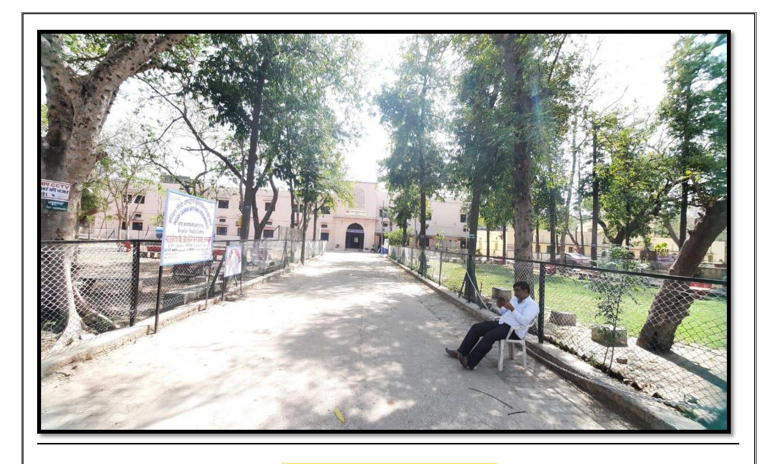
<u>Govt. College Watchman</u>