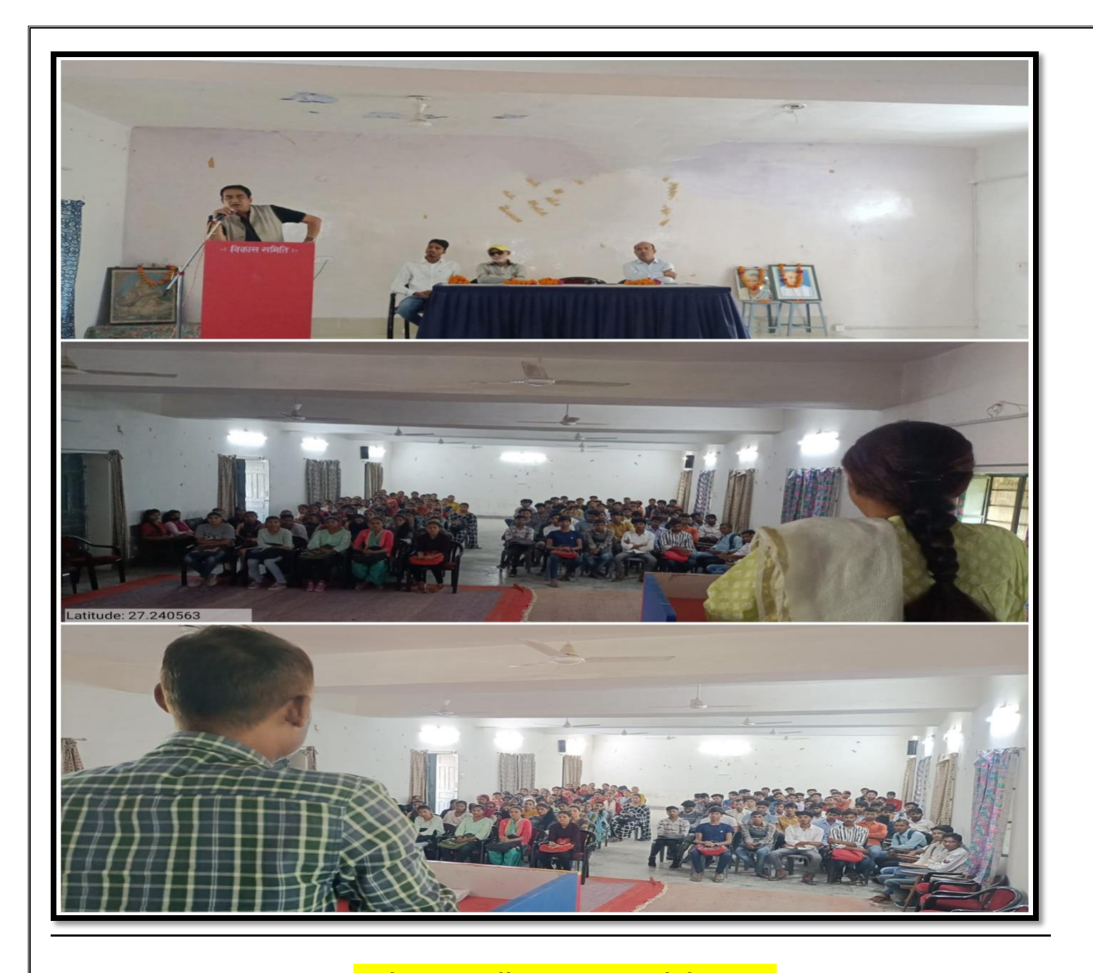
<u>Indira Gandhi Jayanti Celebration</u>