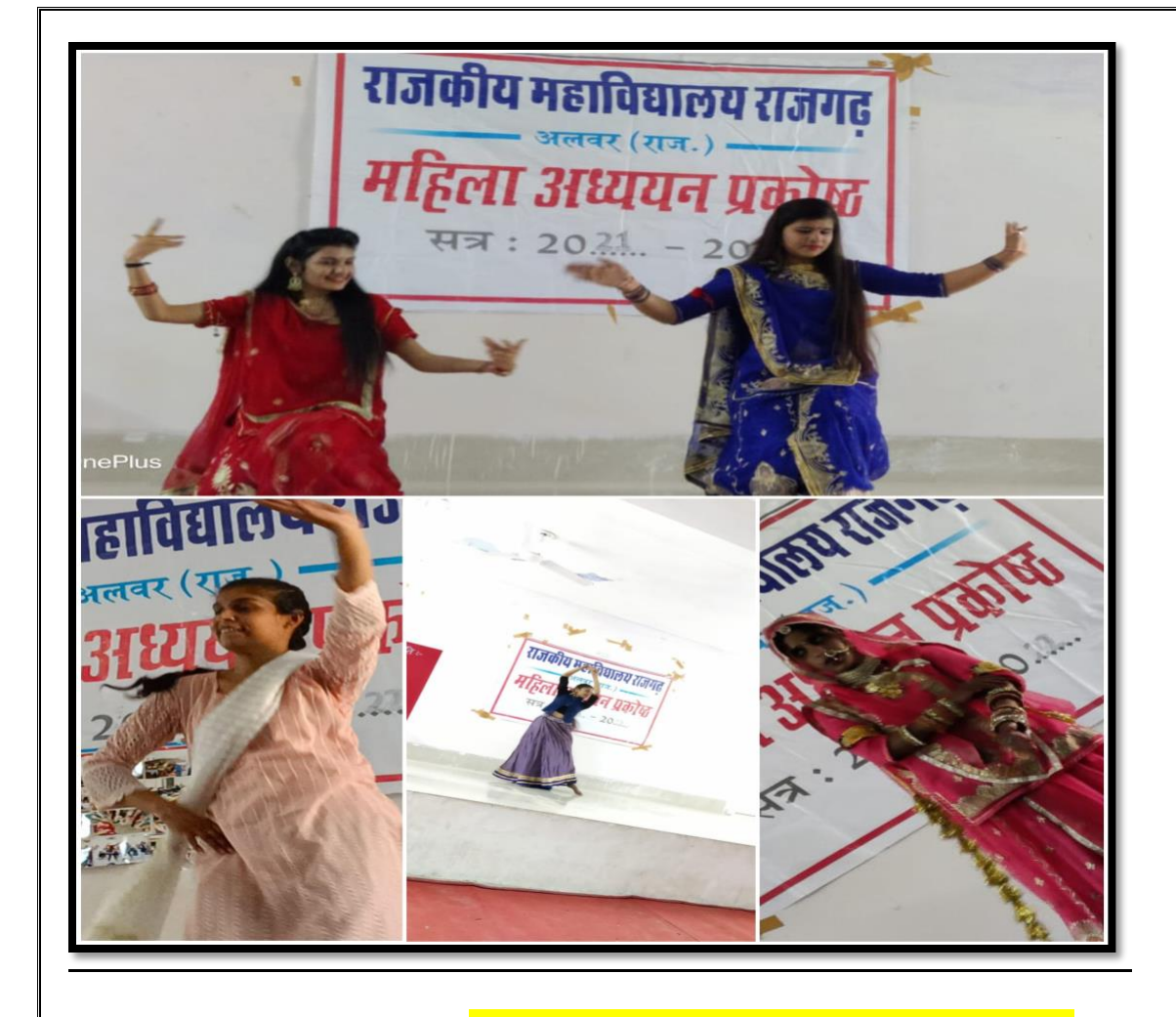
Solo and Group Dance Competition