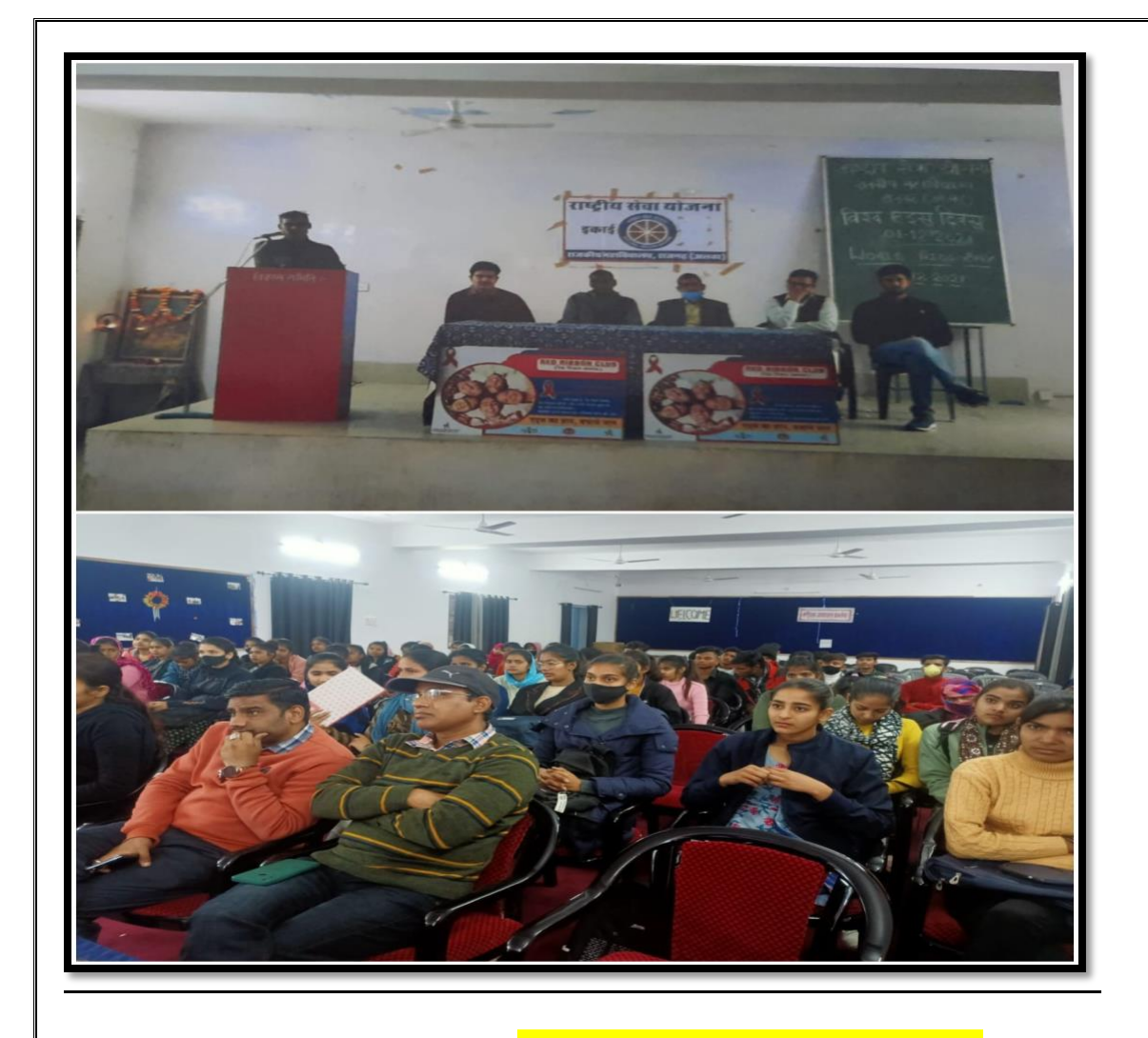
World Aids Day Celebration