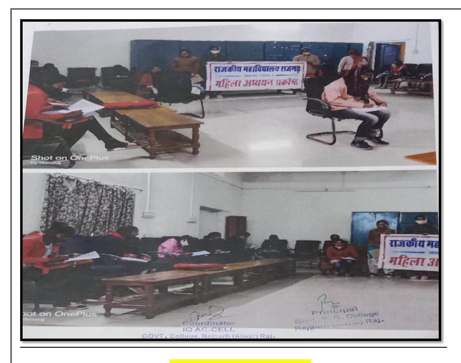
Essay writing Competition