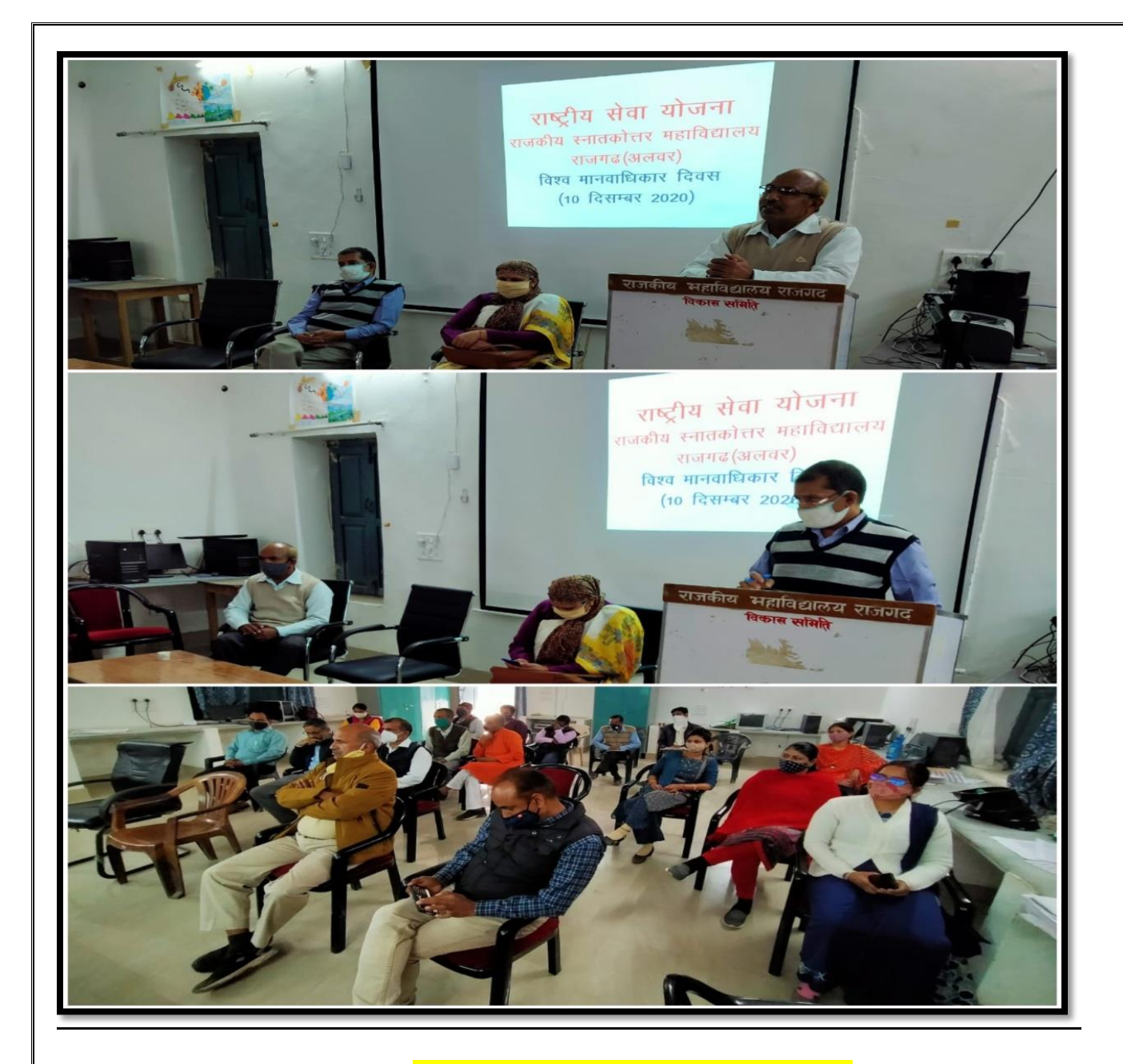
Human Right's Day celebration